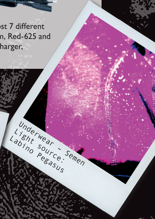
Underwear - Semen Light source: Labino Pegasus

www.labinoforensics.com www.labinonorthamerica.com