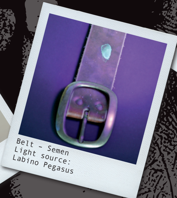
Belt - Semen Light source: Labino Pegasus