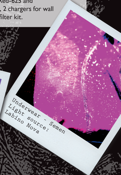
Underwear - Semen Light source: Labino Nova