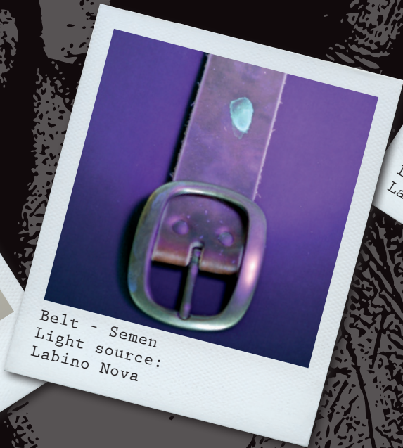
Belt - Semen Light source: Labino Nova