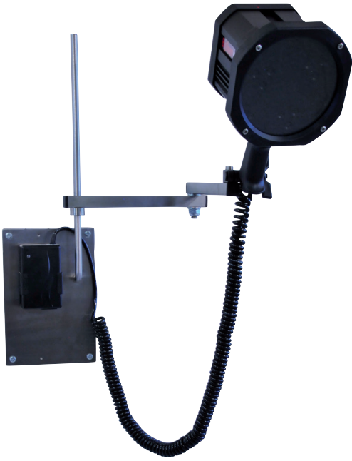
POSITION ON A FLEXIBLE ARM (PIN: A536)