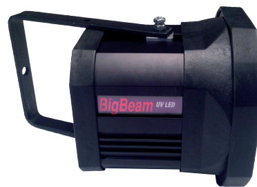
MOUNT WITH MOUNTING YOKE (PIN: F800 & F801)