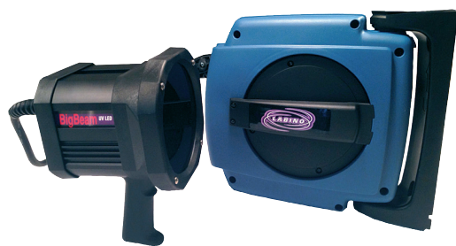
MOUNT ON A CABLE WINDER (PIN: F175)