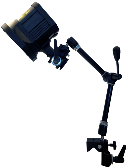
MOUNT ON A FRICTION ARM (PIN: A530)